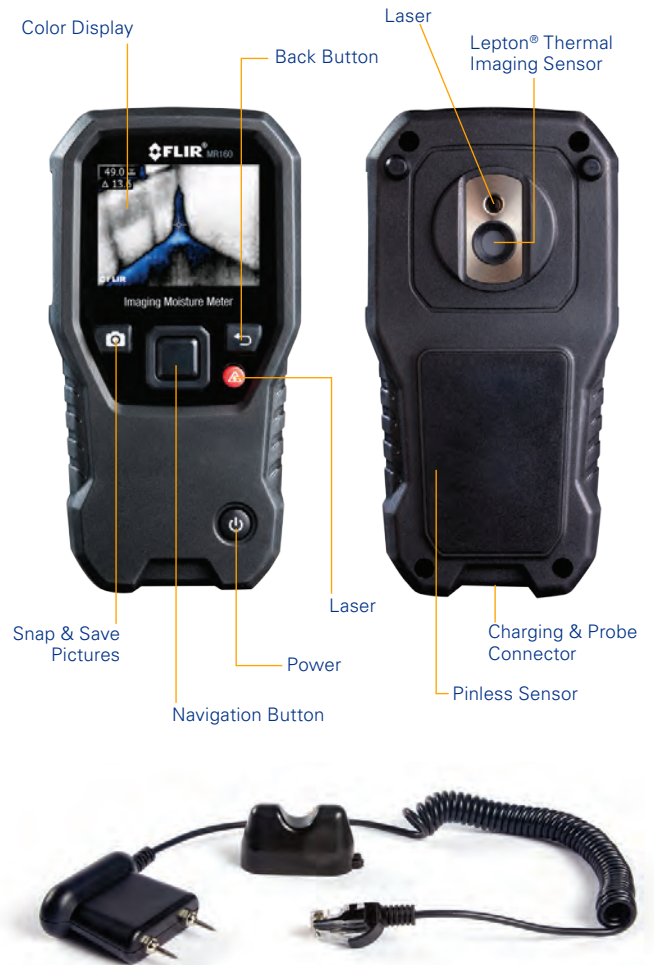
MR02 Pin Probe included

PORTLAND Corporate Headquarters FLIR Systems, Inc. 27700 SW Parkway Ave. Wilsonville, OR 97070 USA PH: +1 866.477.3687